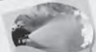
put out fire