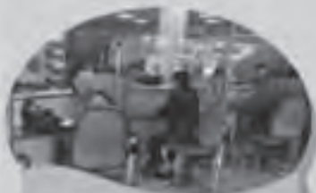
open an account