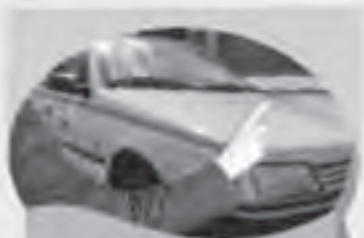
hire a taxi