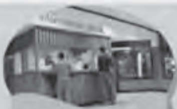
ask the information desk