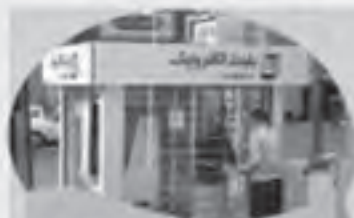
recharge the E-ticket