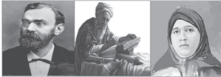
Alfred Nobel Abu-Reihan Bironi Parvin E'tesami

People have always been interested in reading about great men and women. They want to know what makes such people famous. This lesson introduces two of them.